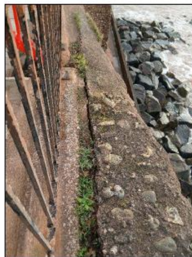
View east along defective section of wall.