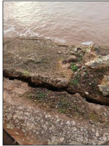
Crack developed to rear of wall.