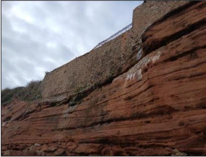
View up to affected wall length.