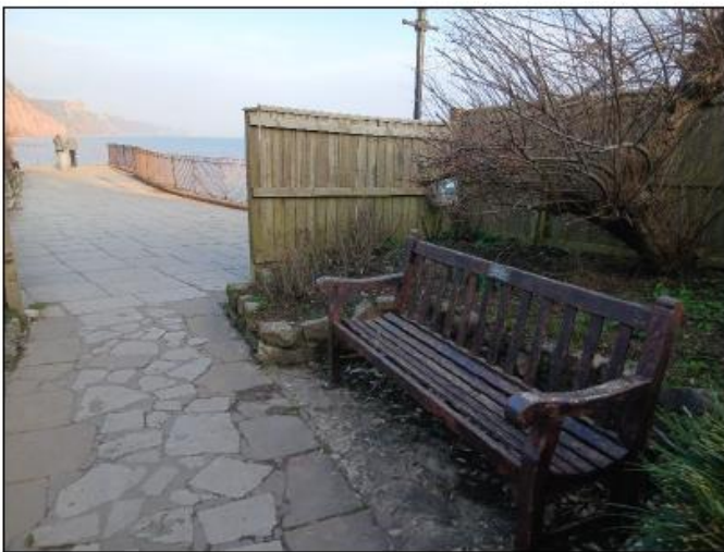
Publicly accessible ground above wall / path immediately above.